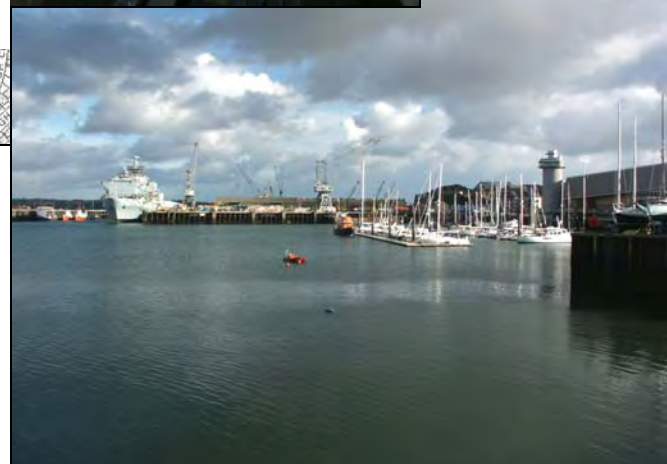
View to Falmouth Docks and National Maritime Museum