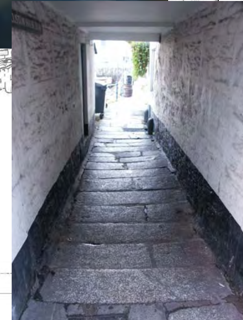
Open and paving, North Quay