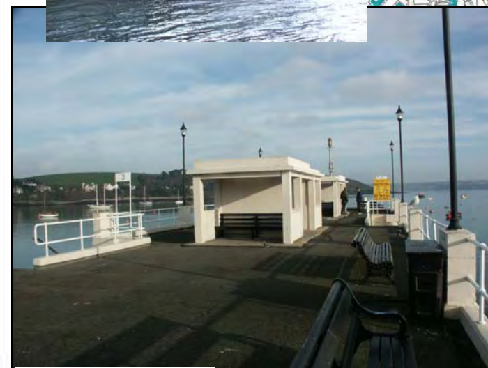
Prince of Wales pier