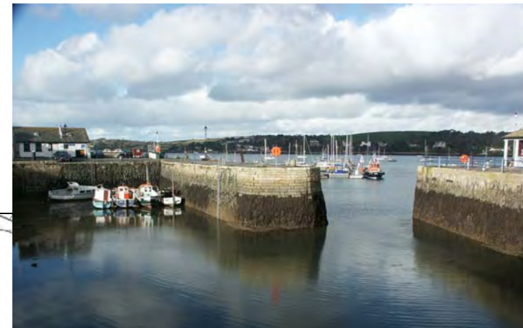
Custom House and North Quays; later 17 th century